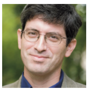
Carl Zimmer Keynote for the public NYT columnist, author, and science journalist